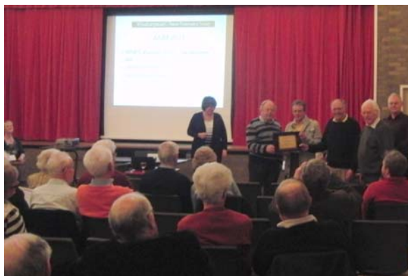
The Station Project Team receive their award.

These are designed to acknowledge the contributions that so many local people make to conserving what is best about Wheathampstead, to making sure that new projects are sympathetic to what already exists and—in short—to making our village all the richer.