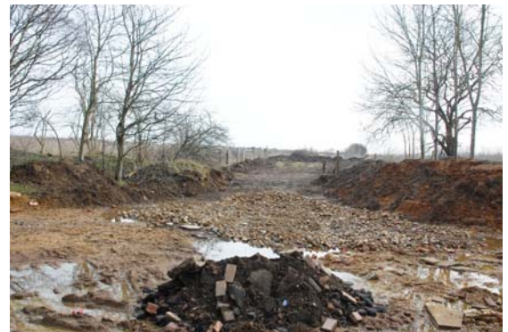
Above: A new entrance to the site is being created, and hardcore has been laid down.

The intention is clear: to permit access for large lorries on to the site from Codicote Road. We are pursuing the matter with Herts County Council.